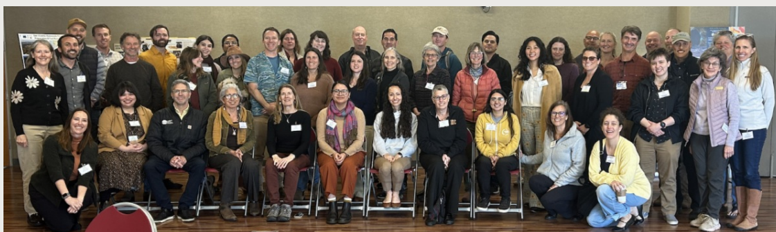
MBCAAN members, March 7, 2025